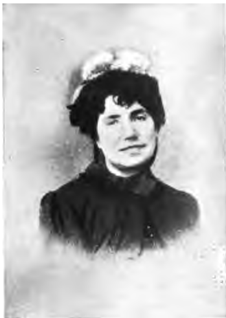
Rosalía de Castro